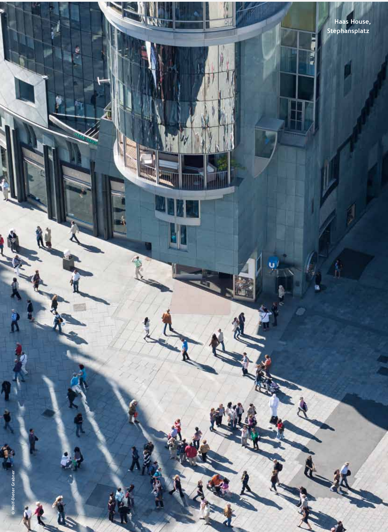
Haas House, Stephansplatz