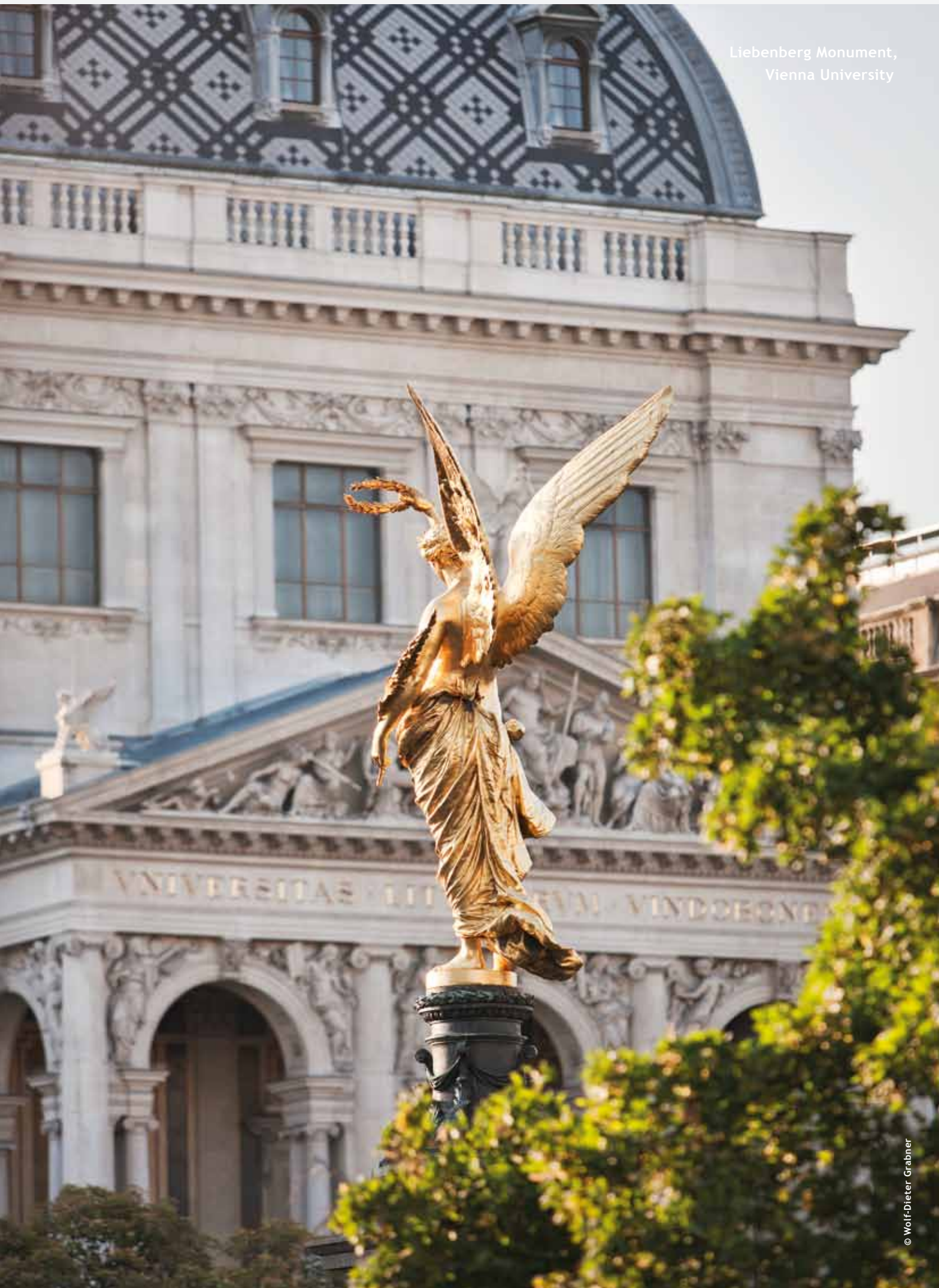
Liebenberg Monument, Vienna University