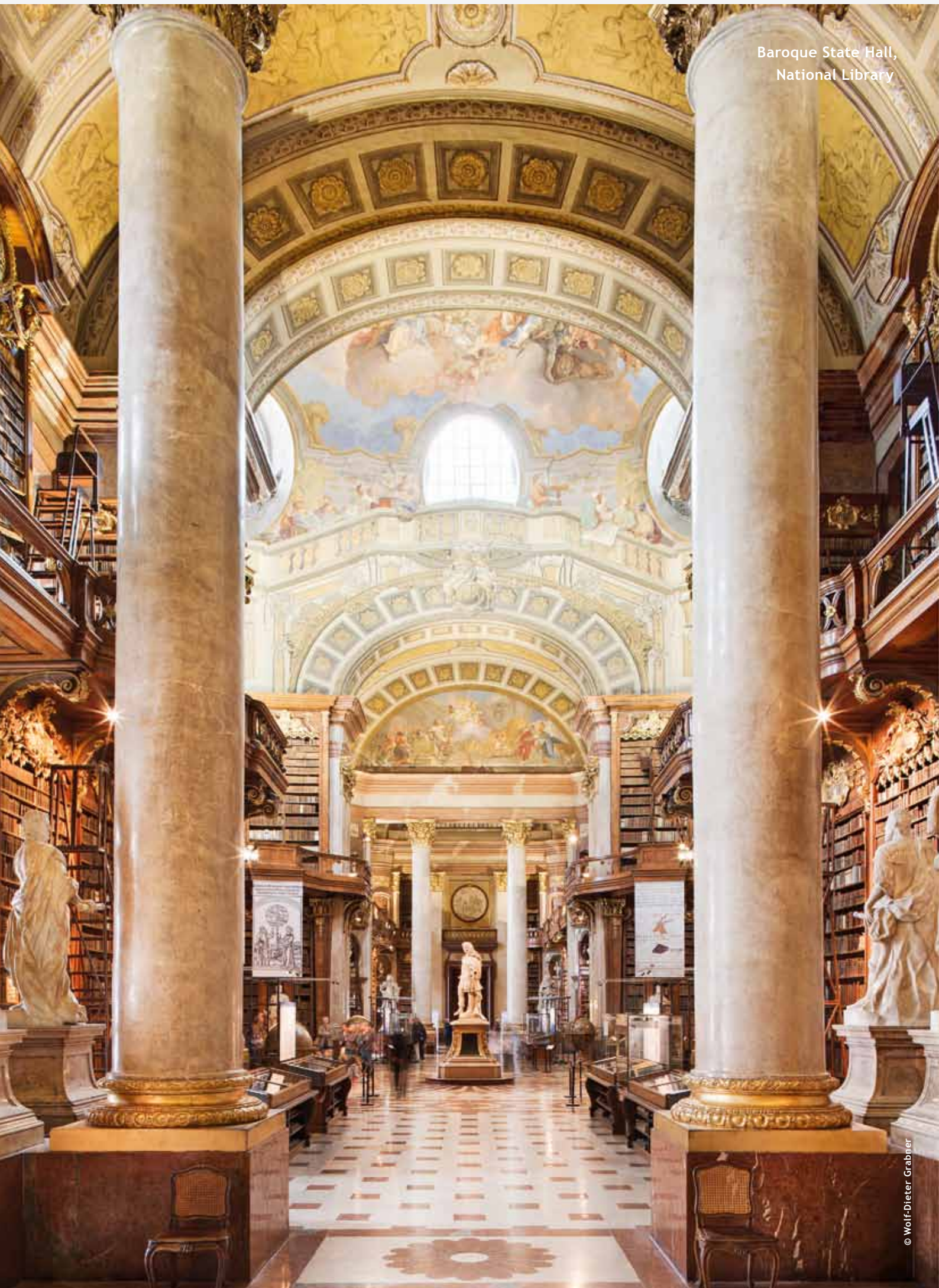
Baroque State Hall, National Library