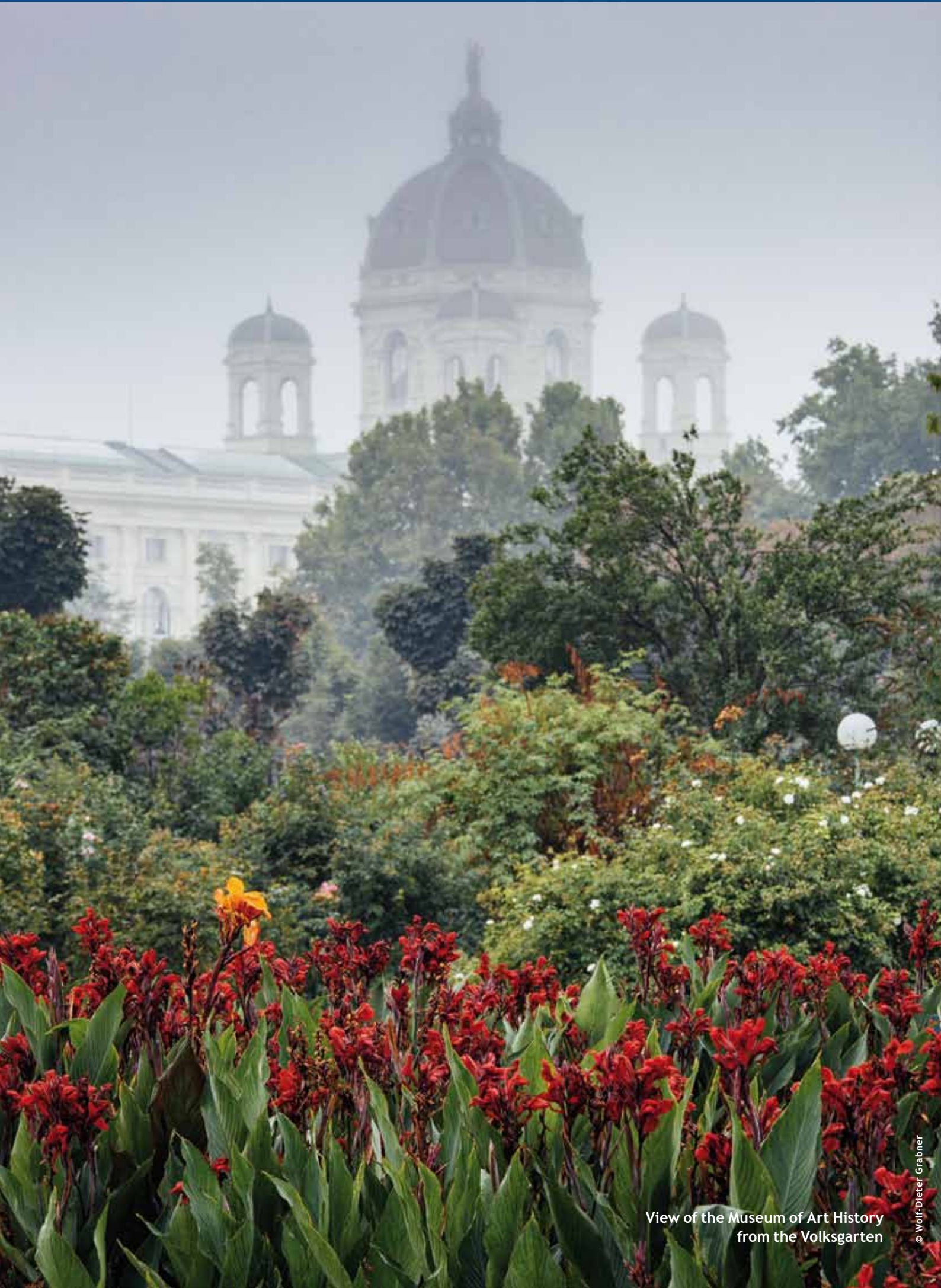
View of the Museum of Art History from the Volksgarten